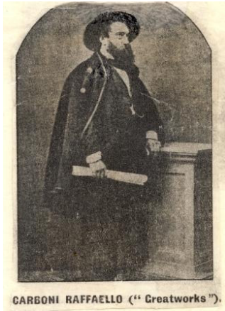
Carboni Raffaello ("Greatworks")

Raffaello Carboni was born on 15 December 1817 at Urbino, Italy. He attended University in 1835-36, but some time around 1837, he moved to Rome where he trained for the priesthood. Carboni studied French, German, Spanish and English. He later left the seminary and became a clerk in a bank. In the 1840s, he joined the Young Italy movement and fought for Garibaldi. In the Roman campaign of 1849, Carboni received three wounds, one of which, in his left leg, never properly closed and troubled him intermittently for the rest of his life.